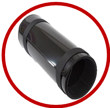
Replacement Sliding Board