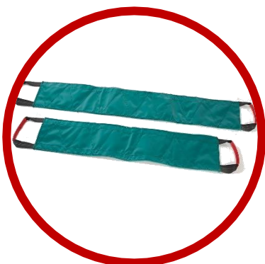
Casualty Handling Slings